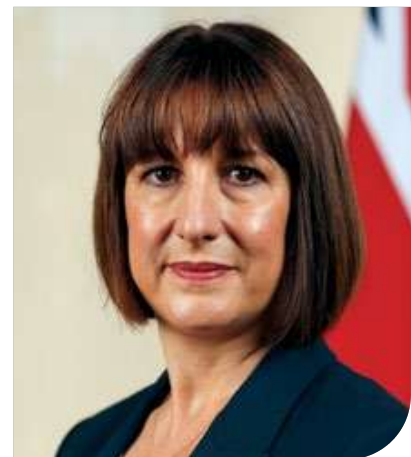
Official portrait of Rachel Reeves MP

Other significant tax increases included higher capital gains tax rates and a future reduction in inheritance tax business and agricultural reliefs. Despite the additional revenue, the Office for Budget Responsibility (OBR) projects that increased spending will mean that borrowing will still be over £70 billion in 2029/30. Not without reason does the OBR say, “...this Budget delivers a large, sustained increase in spending, taxation, and borrowing”.